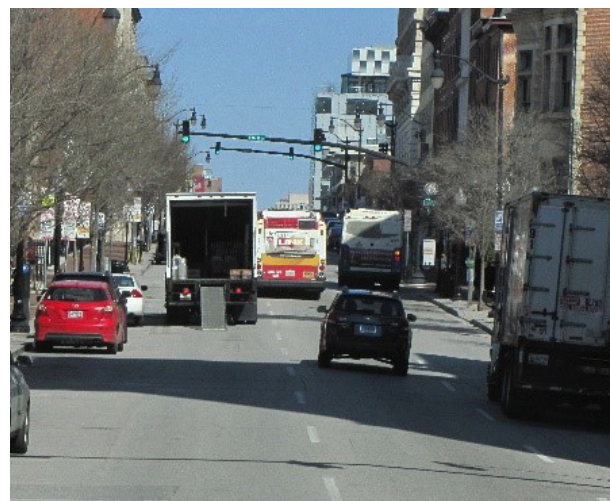
Figure 1: Example of urban freight delivery/parking in downtown Baltimore

The region is experiencing freight movement challenges in two key areas: the City of Baltimore's Central Business District (CBD) and the new Tradepoint Atlantic development at Sparrows Point in Baltimore County. The CBD is a busy tourist area with a limited grid system and many ongoing development projects producing increased congestion (see Figure 2). Tradepoint Atlantic is a 3,100-acre, multi-modal logistics facility in development on the site of a former Bethlehem Steel plant, located less than 10 miles from downtown