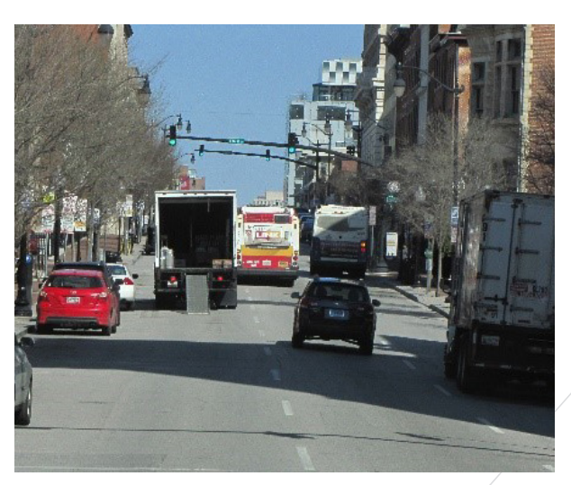
Figure 1: Example of urban freight delivery/parking in downtown Baltimore

The region is experiencing freight movement challenges in two key areas: the City of Baltimore's Central Business District (CBD) and the new Tradepoint Atlantic development at Sparrows Point in Baltimore County. The CBD is a busy tourist area with a limited grid system and many ongoing development projects producing increased congestion (see Figure 2). Tradepoint Atlantic is a 3,100-acre, multimodal logistics facility in development on the site of a former Bethlehem Steel plant, located less than 10 miles from downtown