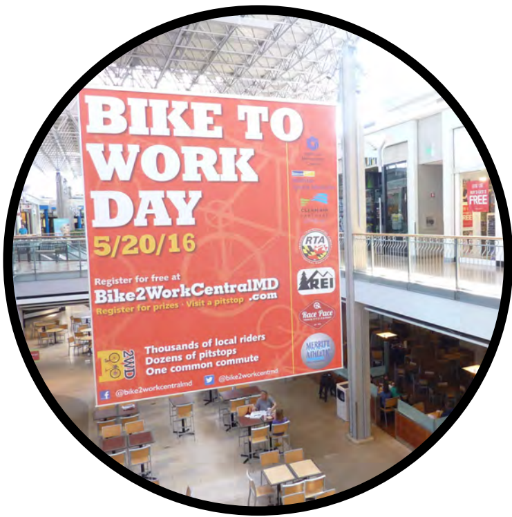
SkyBanner in Columbia