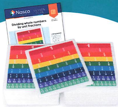
Complete Set of Fraction Tiles with Trays