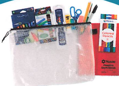
Middle School Student Art Kit with Sketchbook in Bag