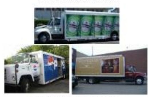
Single Unit Delivery Truck