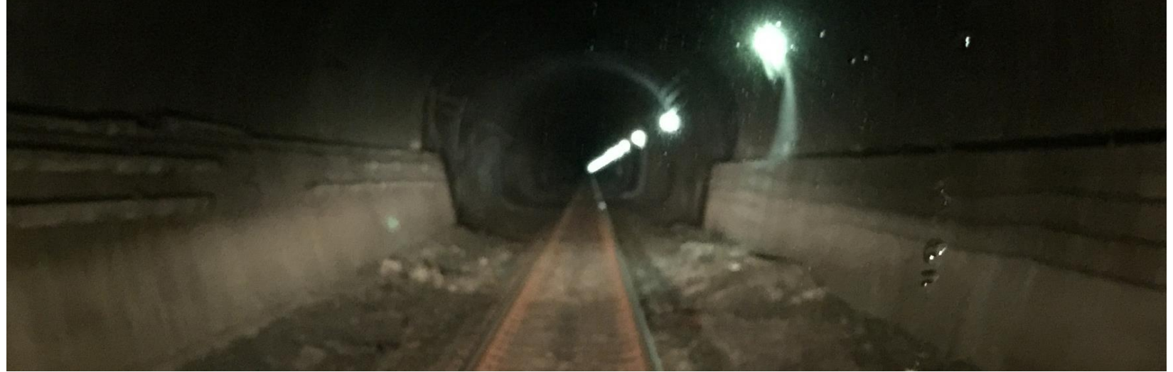
Inside Howard Street Tunnel