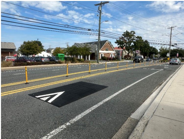
Speed Cushions along both approaches